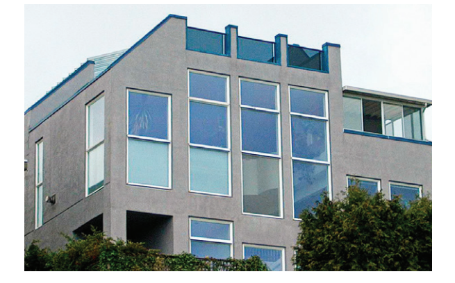
These windows are exposed to wind-driven rain. Water resistant products and installation methods must be used.

Evaluating the exposure to rain is a key part of the discussion that you should have with your replacement contractor, as these decisions will have a significant impact on product selection, installation detailing and cost, as well as on the long-term effectiveness and value of the replacement.