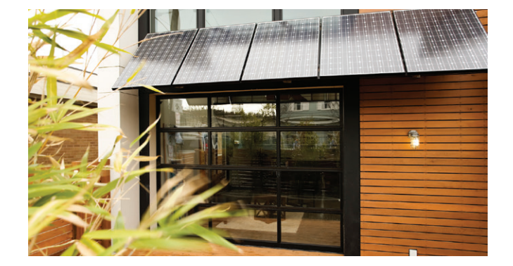
Some window and door locations will likely need greater resistance to water penetration than others.