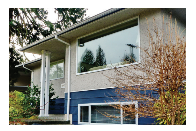
The upper windows on this home are protected by overhangs, allowing for more options when selecting products or evaluating installation methods.